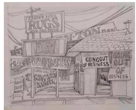
Drawings by Al Staszkesky, Instructor