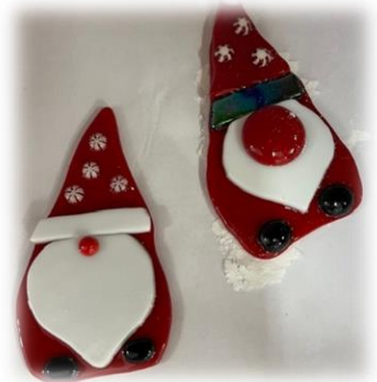
Fused glass project by Patti Rusch

We now have more glass and more glass molds available. Create beautiful glass plates, bowls, jewelry, wall and window hangings and more! Watch a short video on the basics of glass fusing and you are ready to go. Glass prices are posted in the studio.