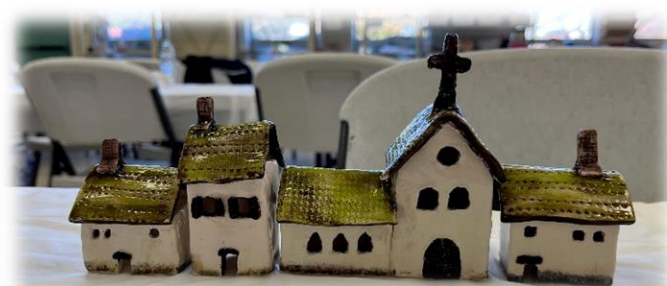
A little village hand-built out of clay and glazed by Gretchen Kritzman.